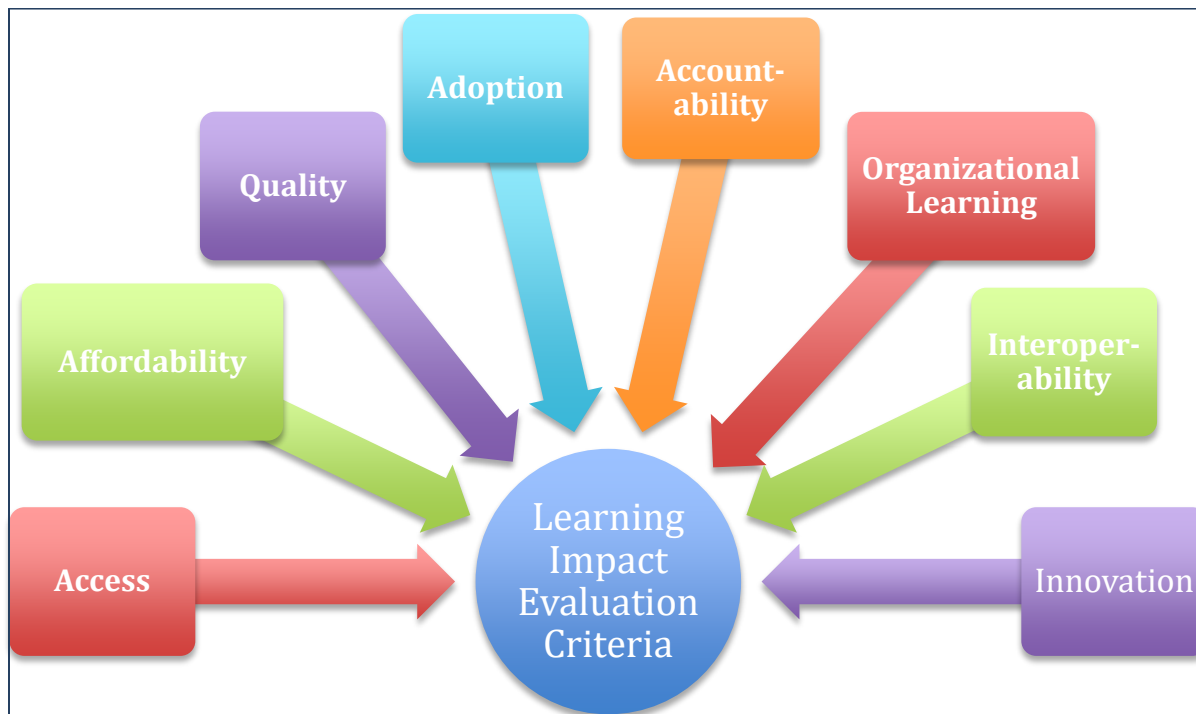
Figure 1--Learning Impact Award Evaluation Criteria

What distinguishes IMS Global’s LIA awards is its pragmatic focus. Compared to other award programs in the education sector, a greater amount of work goes into the LIA evaluation process. Judges assess LIA entries based on the use of technology in an educational institution context, using eight learning impact criteria, as illustrated in Figure 1 and further detailed in Appendix B.